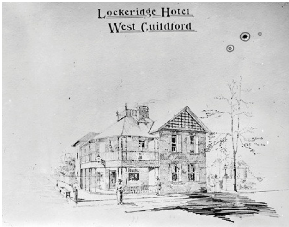
c.1896 sketch of Lockeridge [Lockridge] Hotel, 1 River Street, Bassendean (SLWA 230499PD)