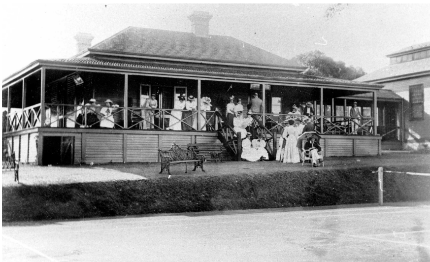
East elevation of The Cliffe at McNeil Street, Peppermint Grove, post-1896, as billiard room at right and other additions have been made (Battye 5395B).