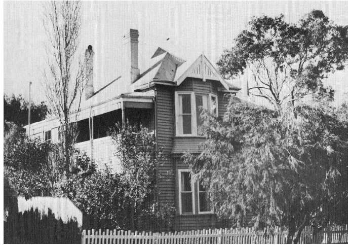
1896-97 weatherboard residence, 37 Leake Street, Peppermint Grove (Pascoe p.52)