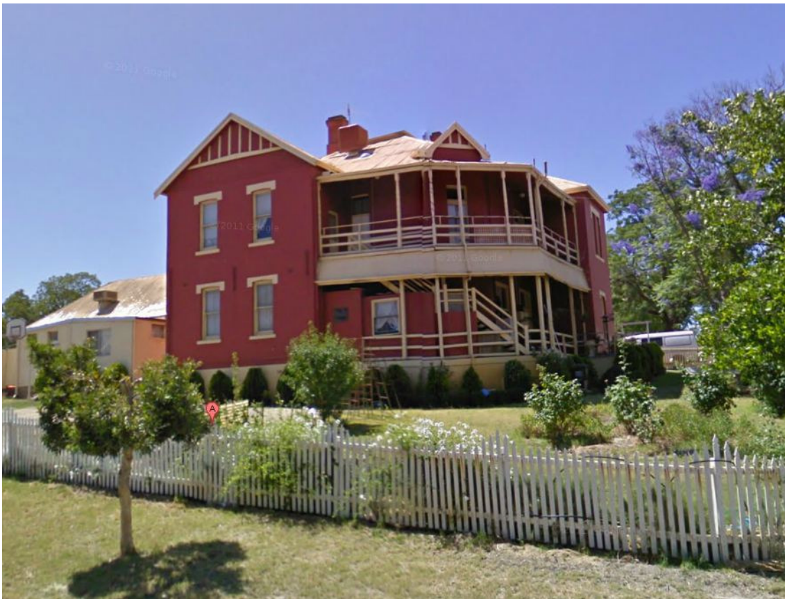
1896 Lockridge Hotel (fmr), 1 River Street Bassendean (Google 2012)