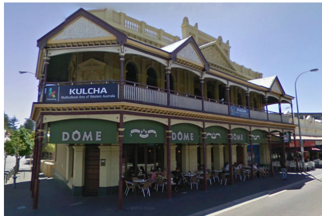
1899 Literary Institute (fmr), 13 South Terrace, Fremantle by Wilkinson Smith & Wilson