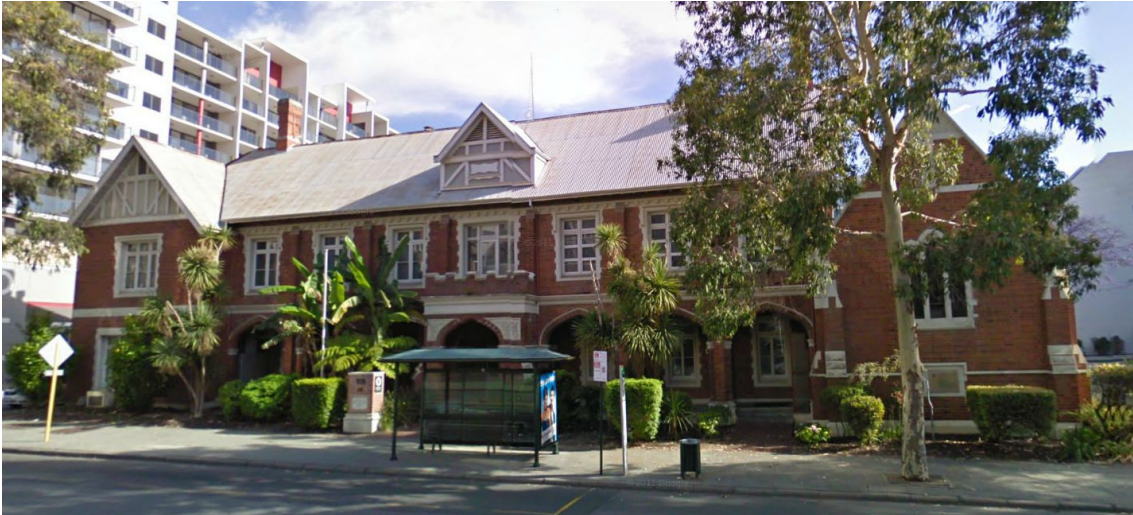
1899 onward: Perth Girls' Orphanage (fmr), 108 Adelaide Terrace, Perth (Google 2012)