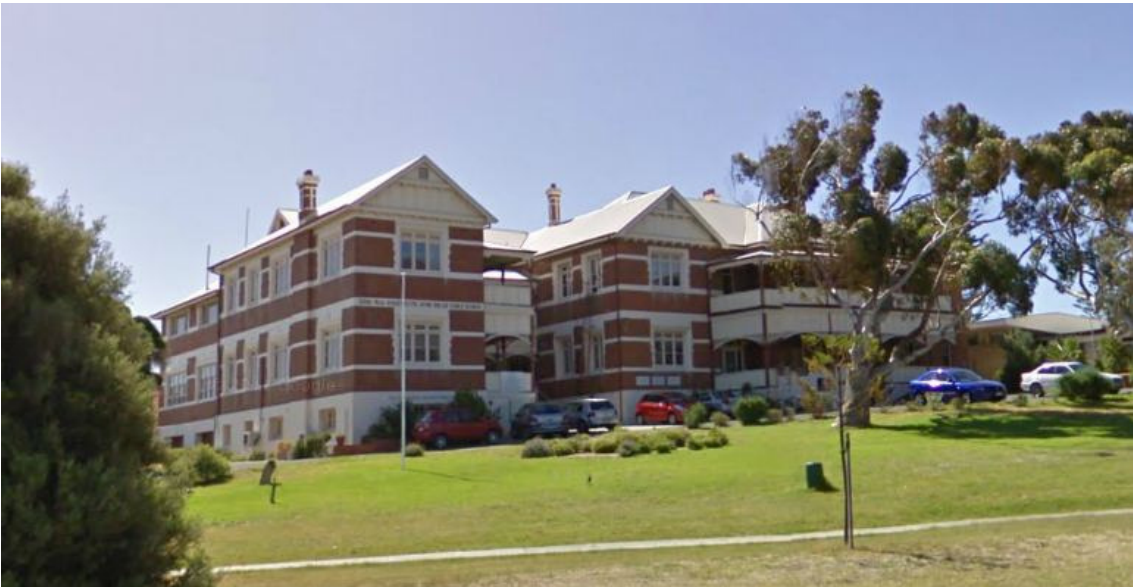
1899-1900 first portions of WA Institute for the Deaf and Dumb (now WA Institute for Deaf Education), Curtin Avenue, Cottesloe